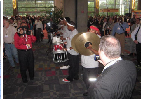
An overview of the main floor as attendees arrive and prepare for the formal opening of the 2010 IFMA WWP Conference & Expo