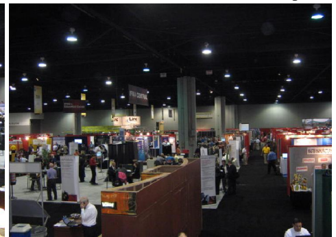
A local drum troupe led attendees to the Expo grand opening ceremonies once inside the Expo came alive with displays and activity