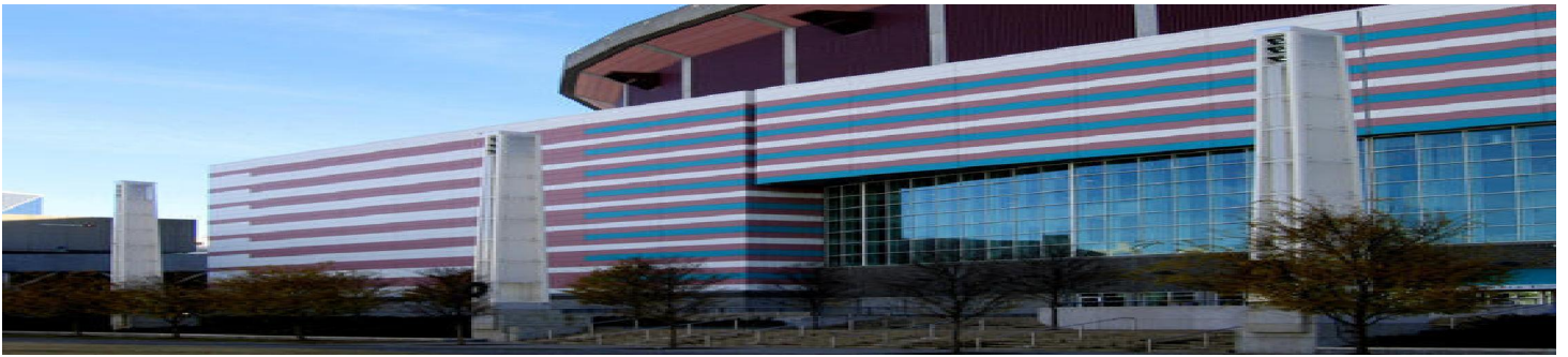
IFMA World Workplace 2010 held at the Georgia World Congress Convention Center (10-26 through 10/29) in Atlanta, GA