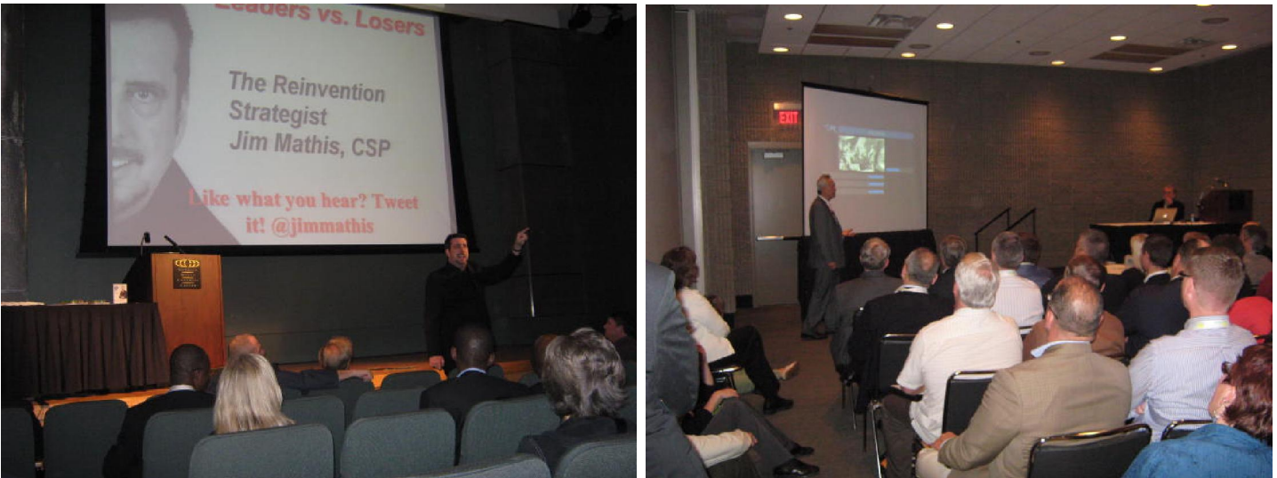
Educational programs were diverse, interesting and informative. Many of the events were standing room only. Most of the educational sessions can be retrieved online on the IFMA website.